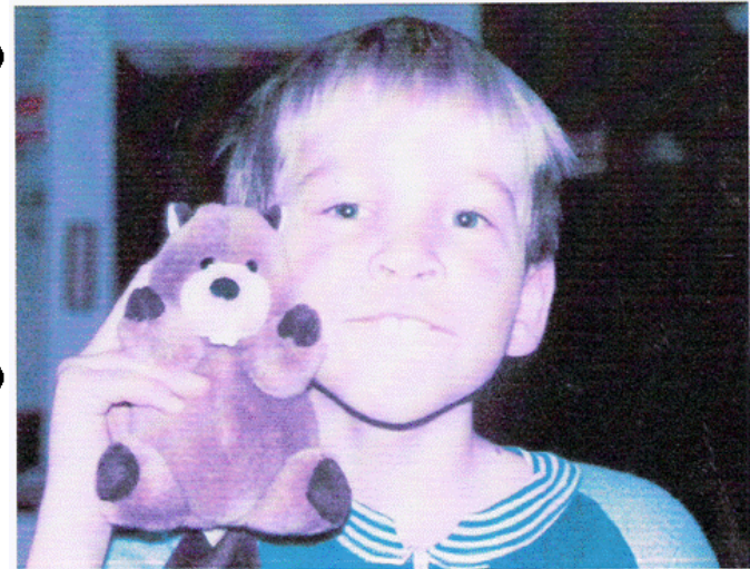
"The human head weighs 8 pounds."