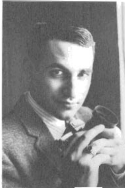
photography editor stephen schnitzer